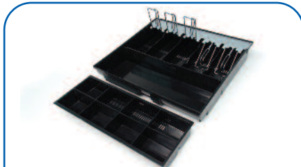
4 Bill, 5 Coin Till / 3 Bill, 5 Coin Till