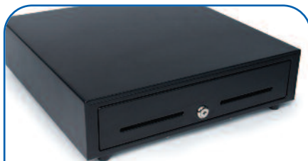
Standard Size 13.0"(W) x 13.2"(L) x 4.1"(H)