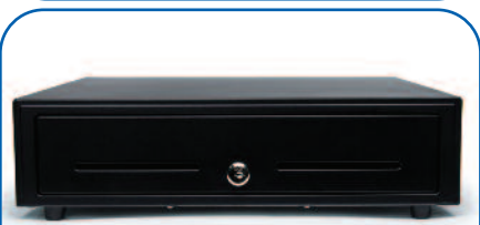
Dual Media Slots for Extra Storage